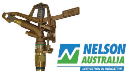
Nelson P85 Gun

Wireless Measuring System for Ma-Rain 56 computer