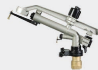
Hidra Part Circle